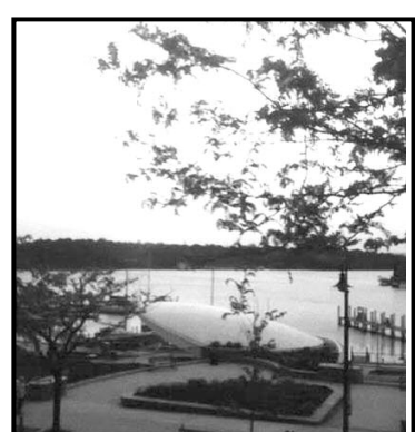
See Building 423 Bridge St. (Top of Villager Pub)