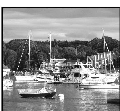
See Building 204 Bridge St.

See Building Large picture windows with magnificent views. Executive offices facing Round Lake. Space can be divided into several offices. Over 2000 square feet. Perfect view and location.